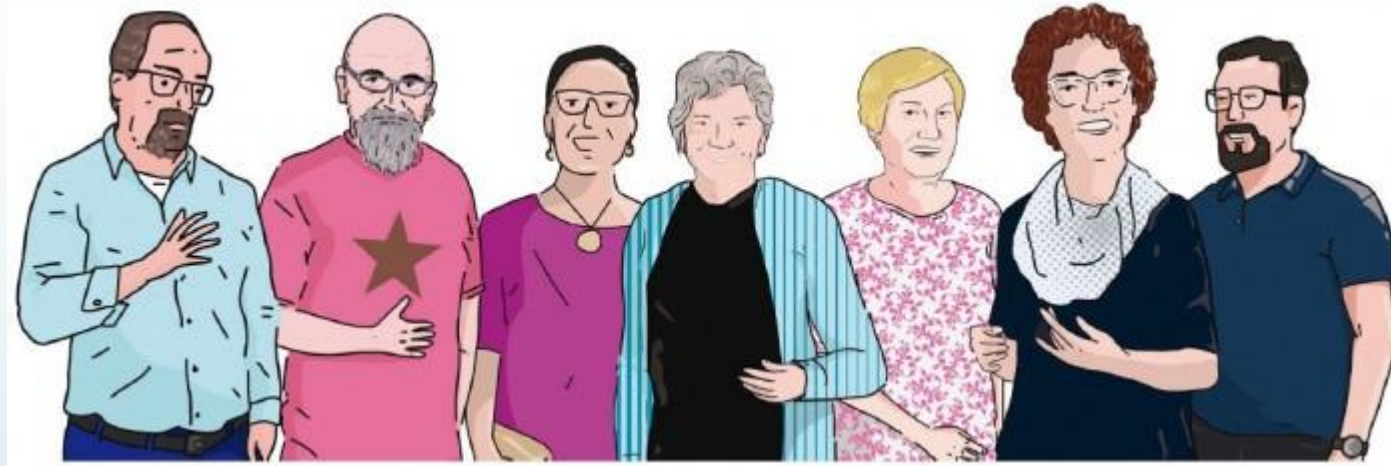
Active Patient Program