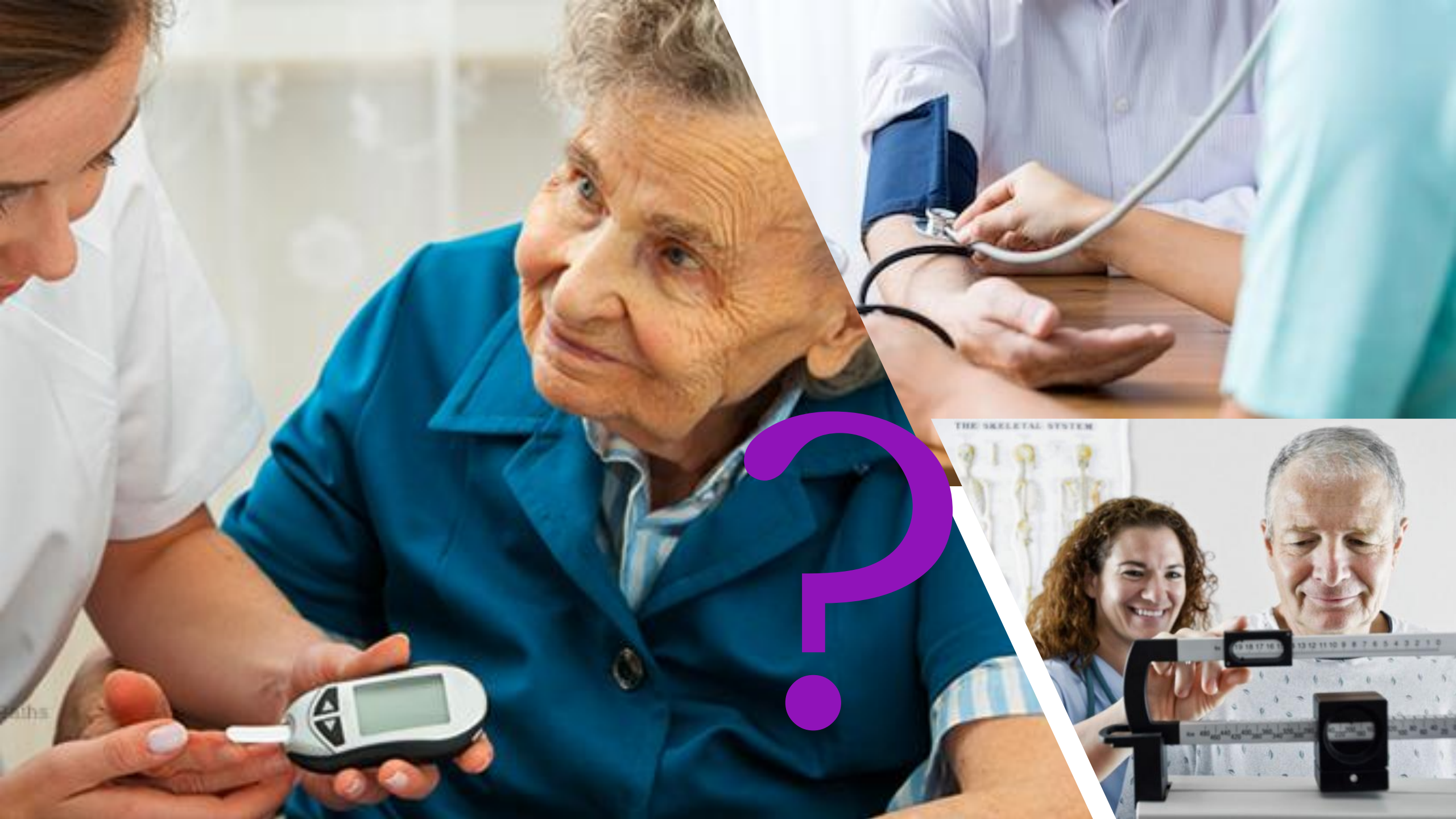
THE SKELETAL SYSTEM